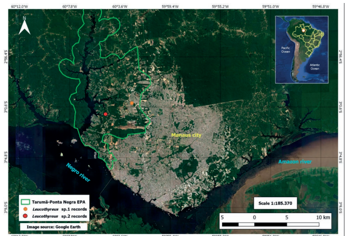
Figure 1. Location map of the records in Manaus.

In the present note, we record two species of Leucothyreus feeding on leaves of Cecropia in the Tarumã-Ponta Negra Environmental Protection Area (Manaus, Amazonas state, Brazil) (Fig. 1), which were collected manually and taken to the laboratory for identification. The plant species were identified based on the literature (Berg 1978; Berg & Rosselli 2005) and through comparison with specimens deposited in the herbarium of the Instituto Nacional de Pesquisas da Amazônia (INPA), whereas the identification of the two Leucothyreus was based on Jameson & Hawkins (2005) and did not reach the species level due to the absence of an available taxonomic revision for this complicated and highly diverse genus. However, both species ( Leucothyreus sp.1 and Leucothyreus sp.2) are hereby illustrated, including high-quality pictures of male dorsal habitus and aedeagus, which will allow for posterior identification (Fig. 2). The pictures of alive specimens feeding on leaves of Cecropia spp. were taken using a mobile phone camera (iPhone SE 2020) with an external macro lens attached, and those of pin-mounted specimens were taken by a Leica M205A stereomicroscope with a Leica DMC4500 camera attached.