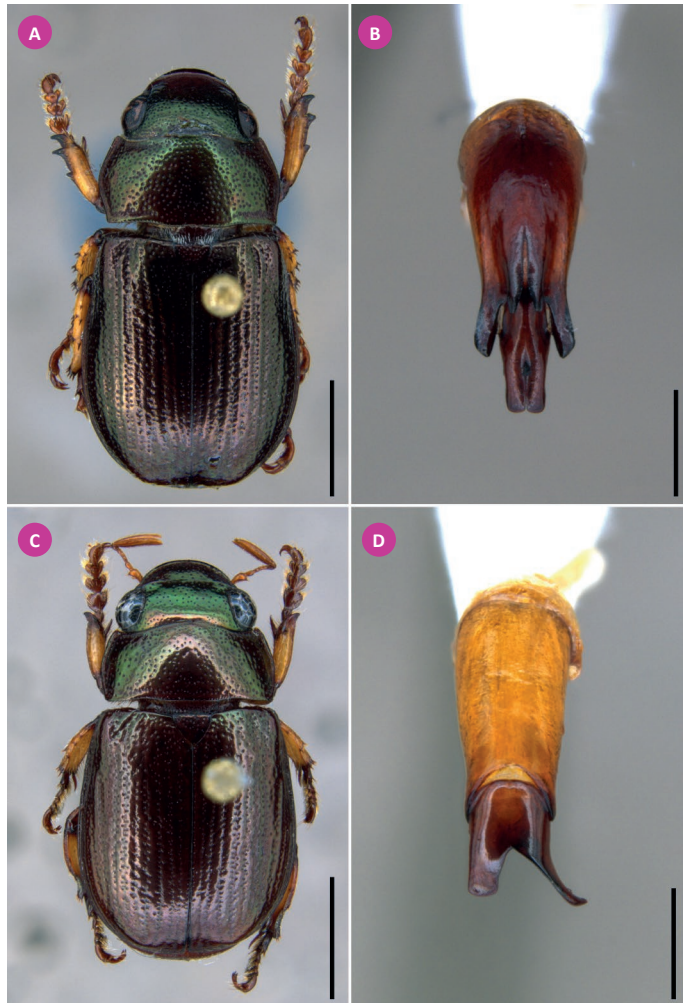
Figure 2. Male dorsal view and aedeagus of Leucothyreus sp.1 (A, B) and Leucothyreus sp.2 (C, D) from Manaus, Brazil recorded in this paper on leaves of Cecropia spp. Scales: A, C = 2 mm; B, D = 0.5 mm.

Leucothyreus sp.1 was observed feeding on the leaves of Cecropia purpurascens C.C. Berg (Fig. 3A) and Cecropia ulei Snethl. (Fig. 3B), as well as other plants like Zoysia japonica Steud. (Poaceae), Muntingia calabura L. (Muntingiaceae), and Cynometra bahiniifolia Benth. (Fabaceae). This finding suggests Leucothyreus sp.1 is a wide generalist species, unlike its congener L. femoratus , which was considered apparently monophagous by Martínez et al. (2013) once it has been only recorded feeding on palm species (Arecaceae). In addition, Leucothyreus sp.2 was observed feeding on the leaves of Cecropia concolor Willd. (Fig. 3C) and Cecropia palmata Willd. (Fig. 3D) in a more conserved fragment of the same locality in which Leucothyreus sp.1 was recorded.