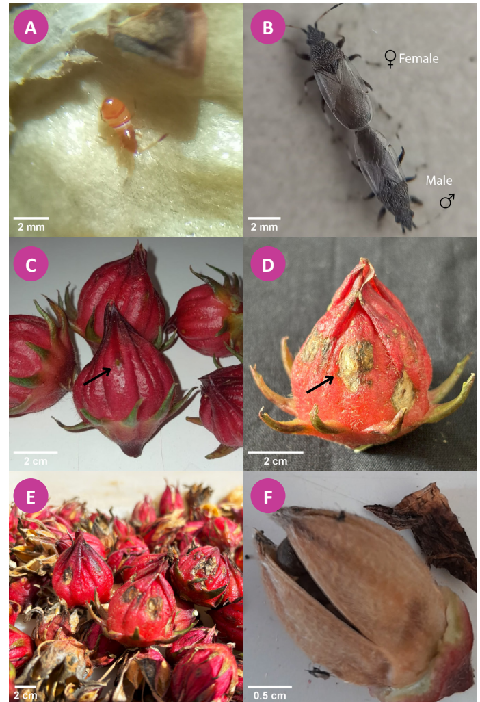
Figure 2. Individuals of Oxycarenus hyalinipennis (Costa, 1847) (Hemiptera: Oxycarenidae) and damage caused to H. sabdariffa . A. Nymph of O. hyalinipennis ; B. Male and female in copula; C. Initial damage on the calyx (arrow); D. Progression of injury on the calyx (arrows); E and F. Dried calyx with presence of O. hyalinipennis individuals.

The diversity of host plants presents in the transition zone between the Cerrado and the Atlantic Forest is likely what favours the maintenance and dispersal of O. hyalinipennis populations (Jordão et al. 2024). In addition to species from the Malvaceae family (e.g. cotton, okra, and hibiscus), the insect has been recorded on plants from other families, which reinforces its polyphagous and adaptive potential (Abdel-Moniem et al. 2011; Shah et al. 2016). Given the economic, nutritional, and medicinal importance of roselle (Vasavi et al. 2019), the presence of this pest represents a challenge for production systems in the region. Future studies are necessary to understand its biology and population dynamics and to develop management strategies.